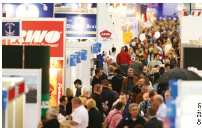
Use PBO's showguide to find the stand you're looking for