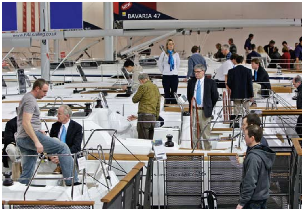
Looking for a new boat at the show? Turn to page 28 for our 8-point guide to help you choose

N = North Hall S = South Hall D = Marina